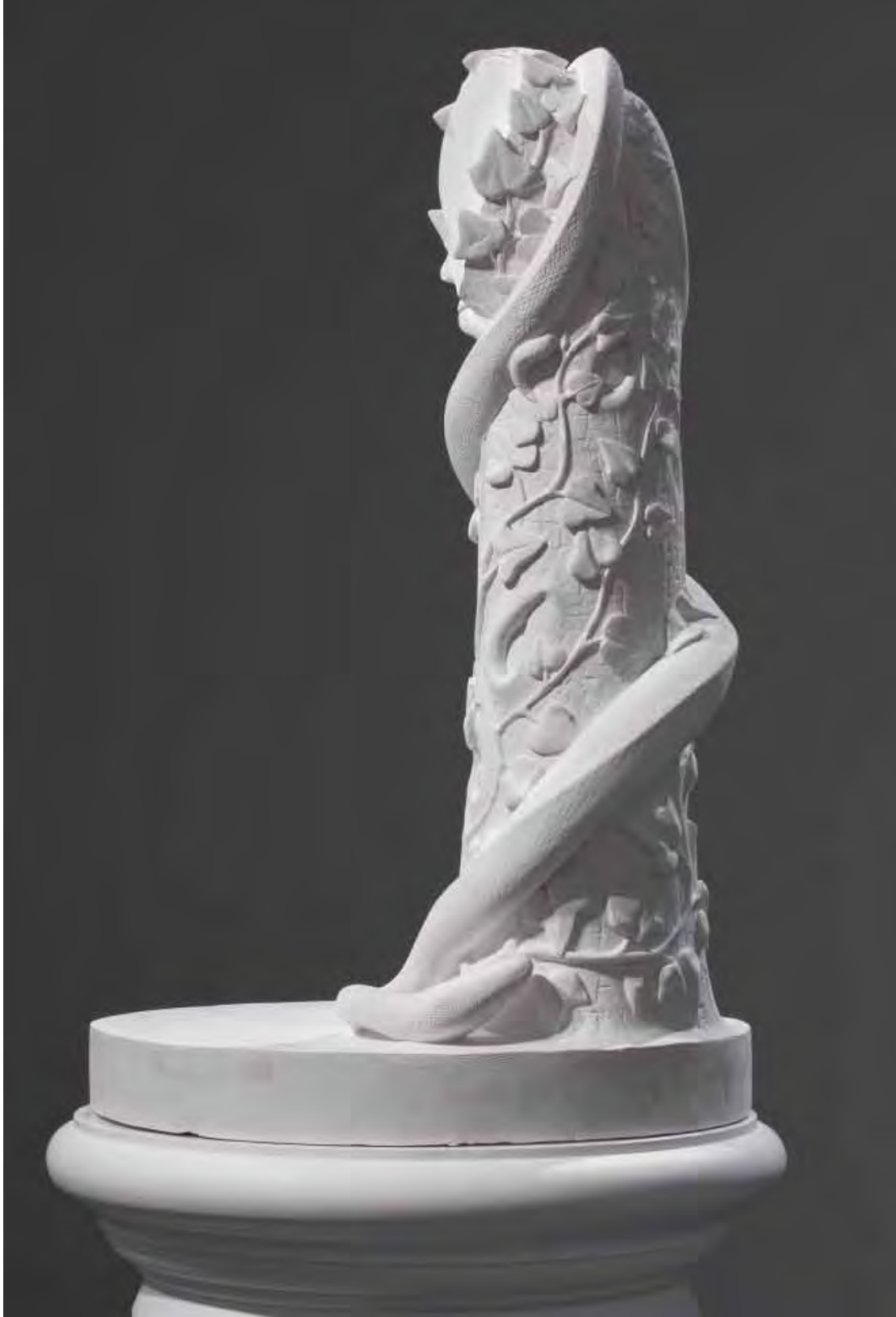
Lily Cox-Richard, The Stand: Eve Disconsolate , 2013 , plaster, 69 x 26 x 26 in. (175.3 x 66 x 66 cm) (artwork © Lily Cox-Richard)