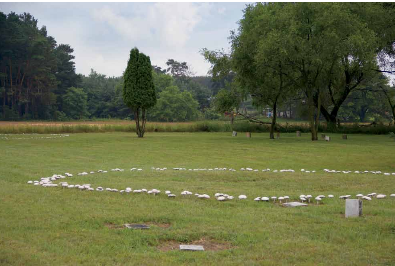
Lily Cox-Richard, Fruiting Bodies , 2011, cast aqua resin, ht. approx. 5 in. (12.7 cm), diam. approx. 30 ft. (9.1 m), installation view, The Great Poor Farm Experiment, Manawa, Wisconsin, 2011 (artwork © Lily Cox-Richard)

implicit promises of speed and ease. For the question she asks is whether we can only begin to think of sculpture seriously when its constituent elements no longer fuse into a seamless unity, but in fact fall hopelessly apart into related but irrefutably separate elements that in turn cannot be described as anything except sculpture. We might even suspect Cox-Richard of wanting to think first of sculpture's material presence, of its frailty and durability, of its size and scale, before considering its capacity for narrative representation. This is not to suggest that she neglects the latter—the very subtitle of her most recent project, Possessing Powers , is a deft jab at a particular history of American sculpture championed for how its exemplars allegedly embody, or at least represent, ideals of fairness as implied by the Abolitionists' promotion of The Greek Slave , yet whose parameters are deeply inflected by the systematic exclusion of women and people of color. Likewise, the subtitle may be understood as Cox-Richard's claim to ability, as her desire to supernaturally engage with the earlier artist across time and space, and even as a deferred attempt to suggest that it is she who now claims and even owns Powers.