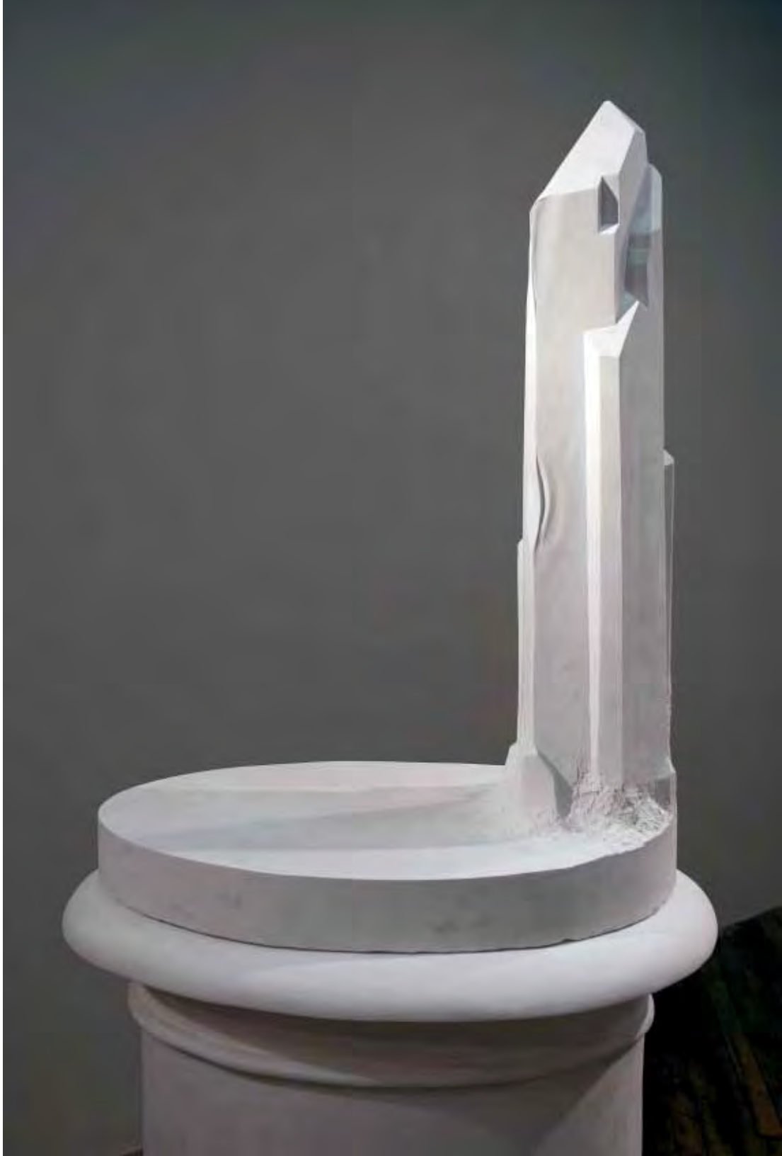
Lily Cox-Richard, The Stand: California , 2013 , plaster, 70 x 28 x 21 in. (177.8 x 71.1 x 53.3 cm) (artwork © Lily Cox-Richard)