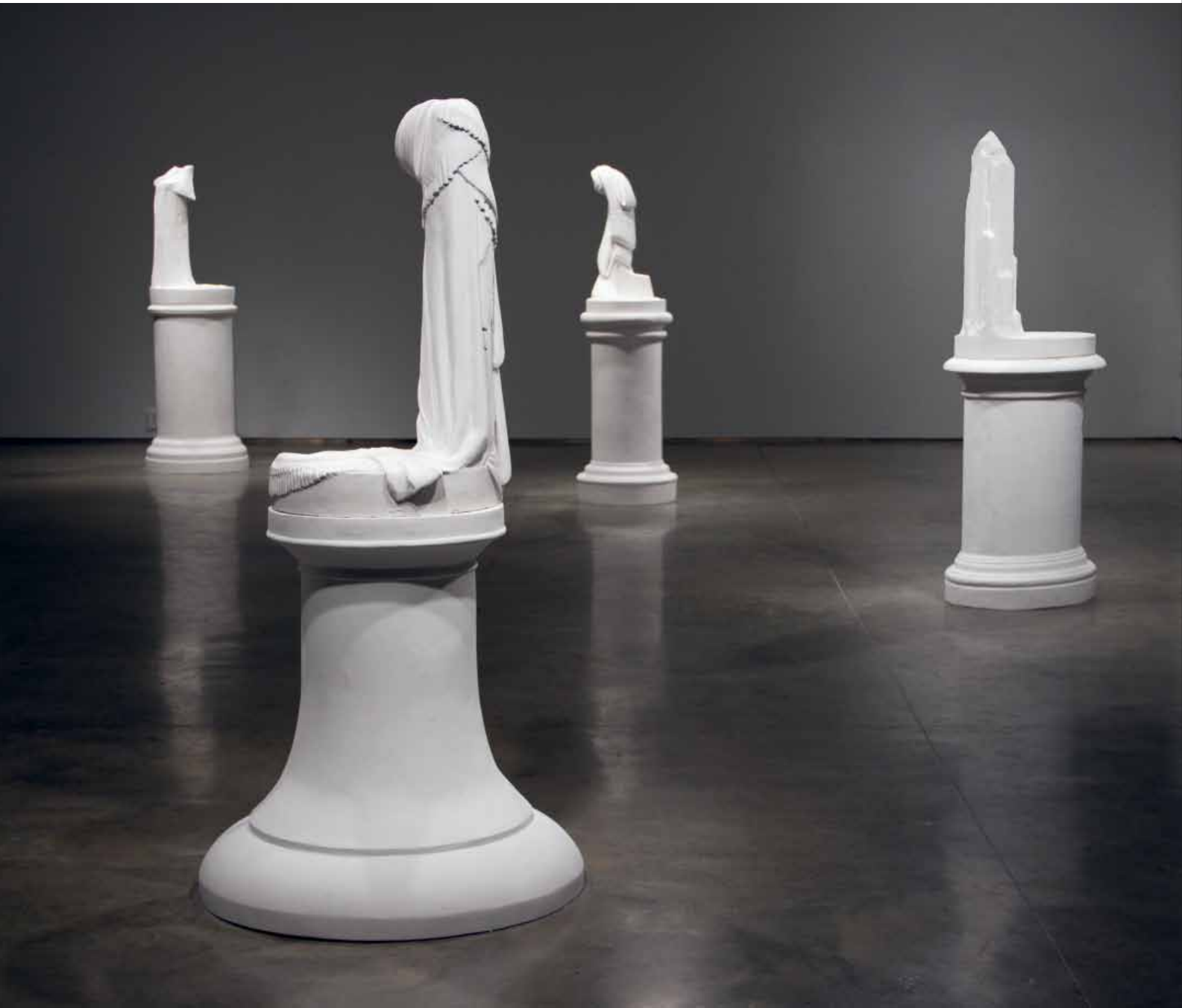
Lily Cox-Richard, The Stand (Possessing Powers) , 2013 , installation view, Second Street Gallery, Charlottesville, Virginia, 2013 (artwork © Lily Cox-Richard)