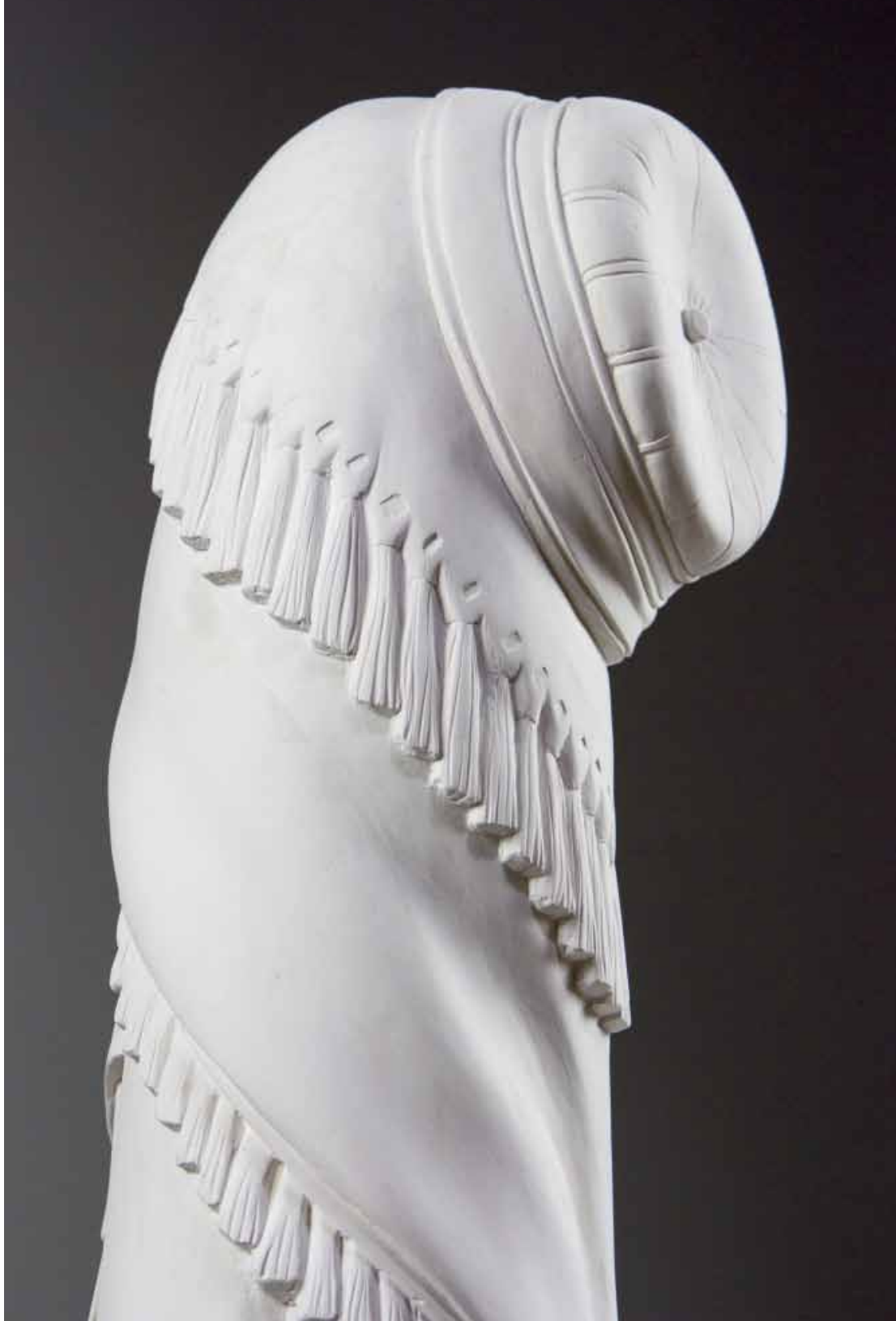
Lily Cox-Richard , detail of The Stand: Greek Slave , 2013, plaster, 66 x 33 x 33 in. (167.6 x 83.8 x 83.8 cm) (artwork © Lily Cox-Richard; photograph by Sharad Patel)