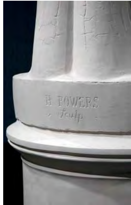
Lily Cox-Richard , details of The Stand: Last of the Tribes , 2010, plaster, 71 x 22 x 22 in. (180.3 x 55.8 x 55.8 cm) (artwork © Lily Cox-Richard)