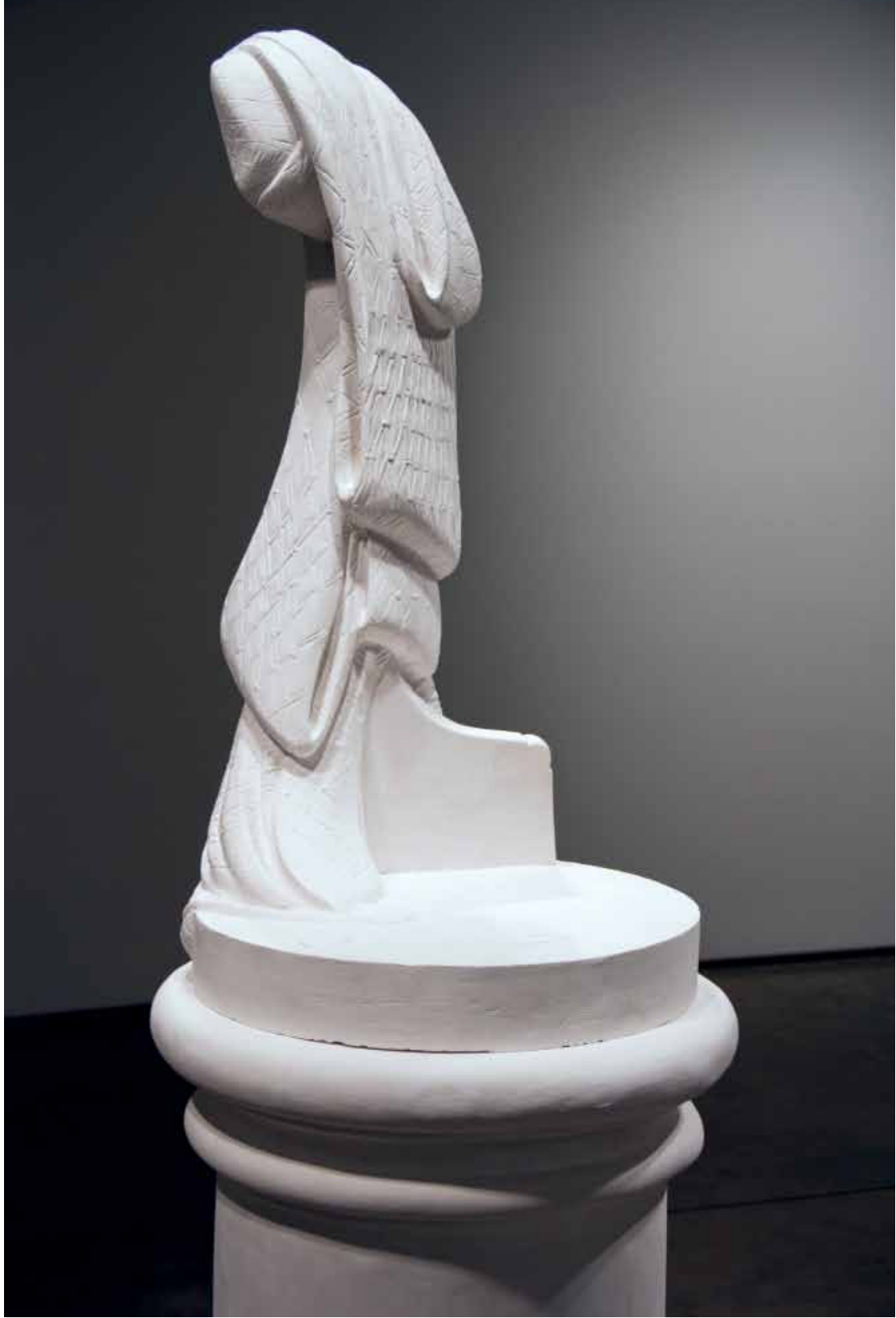
Lily Cox-Richard, The Stand: Fisher Boy , 2013, plaster, 68 x 20 x 20 in. (172.7 x 50.8 x 50.8 cm) (artwork © Lily Cox-Richard; photograph by Sharad Patel)