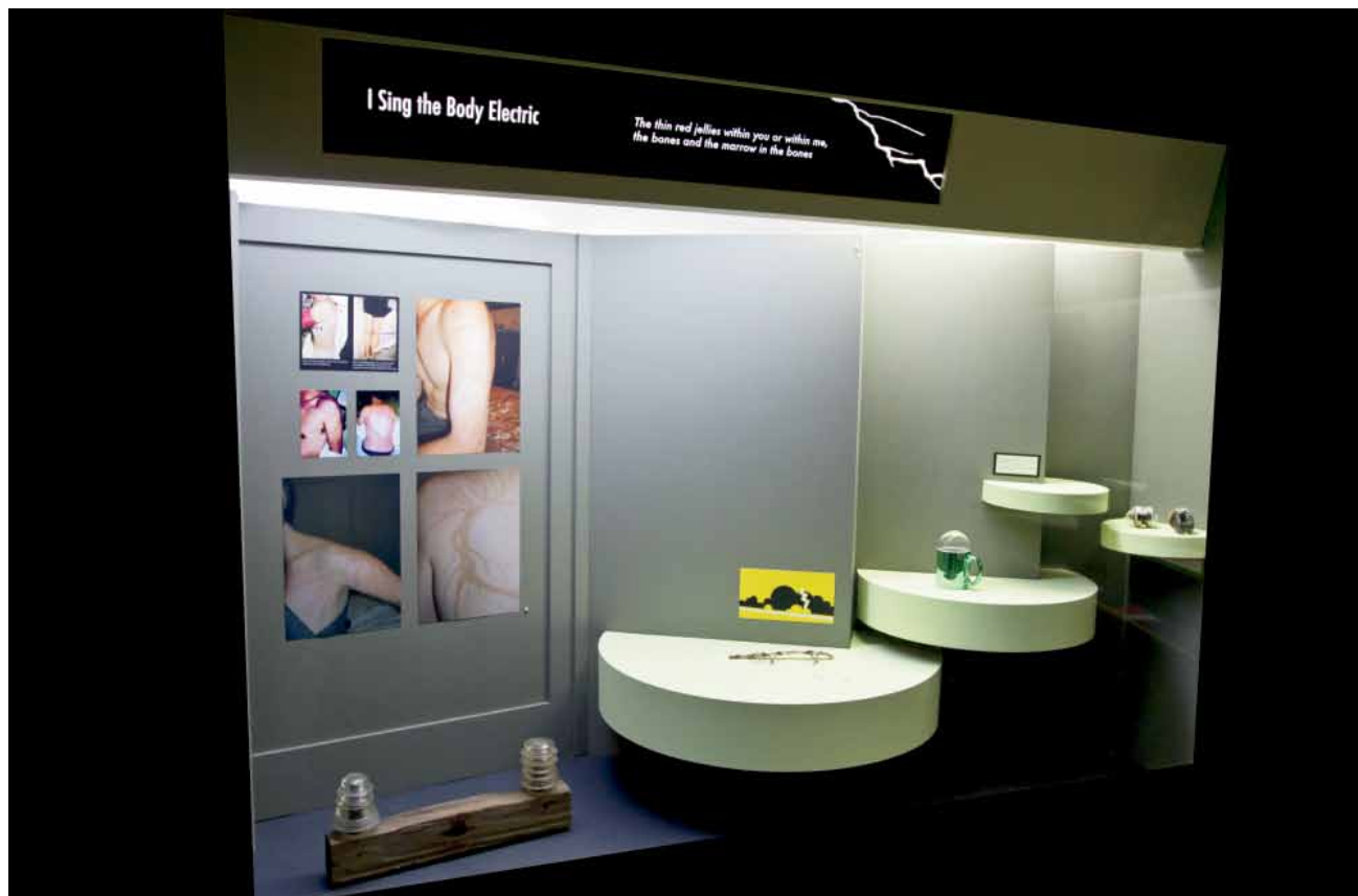
Lily Cox-Richard, "I Sing the Body Electric," detail of Strike , 2012, installation view, SiTE:LAB at the old Grand Rapids Public Museum, 2012 (artwork © Lily Cox-Richard)