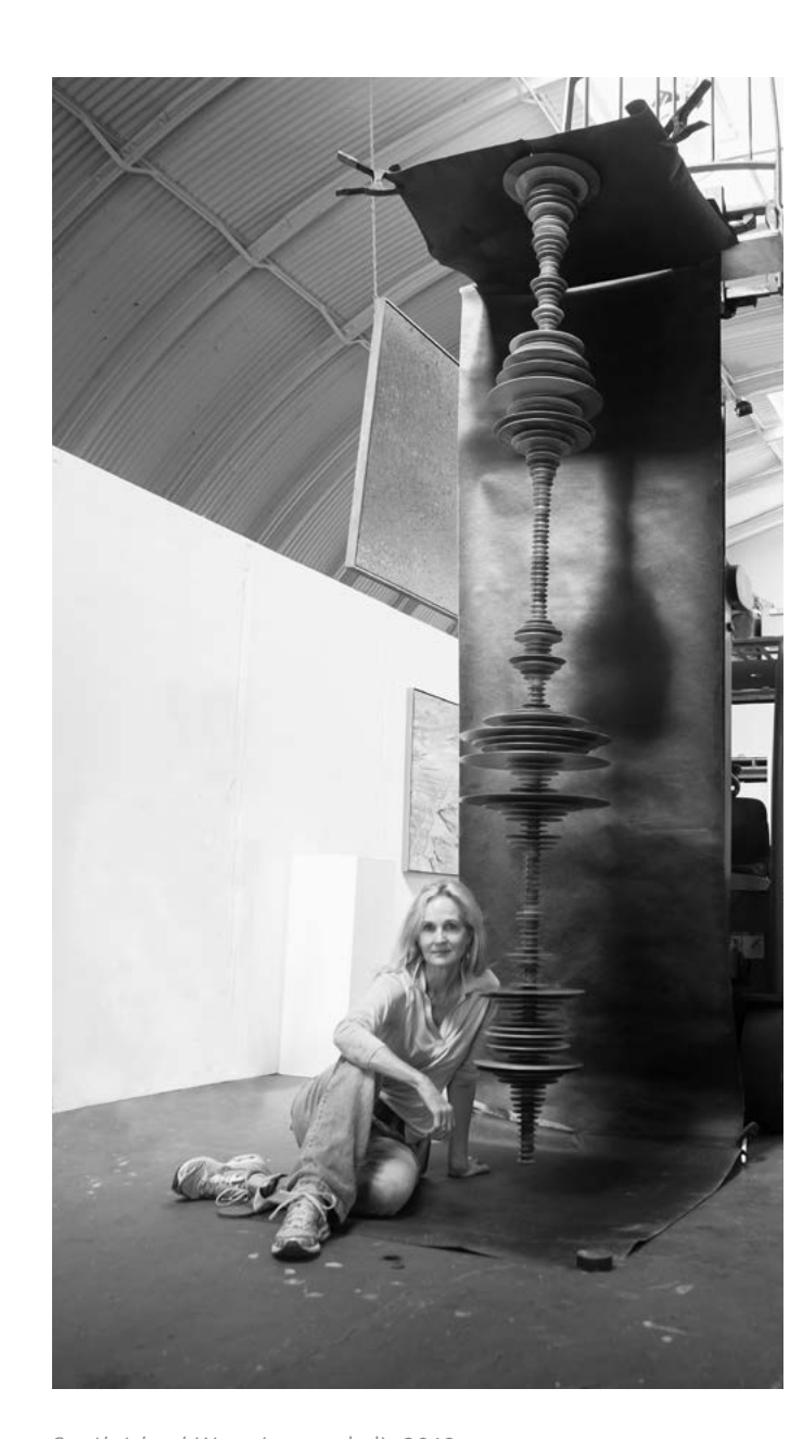
South Island Wren (suspended), 2019 Cherry, 168 in. high x 17½ in. diameter