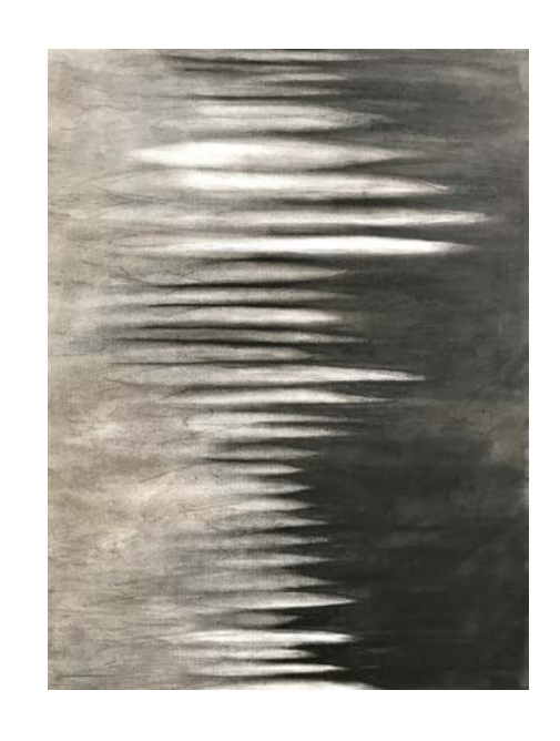
The Air We Breathe 3, 2020 Getty Fire ash and charcoal on paper 24 x 18 in.

OPPOSITE Bald Eagle, 2019 Cherry 90 in. high x 17 ½ in. diameter