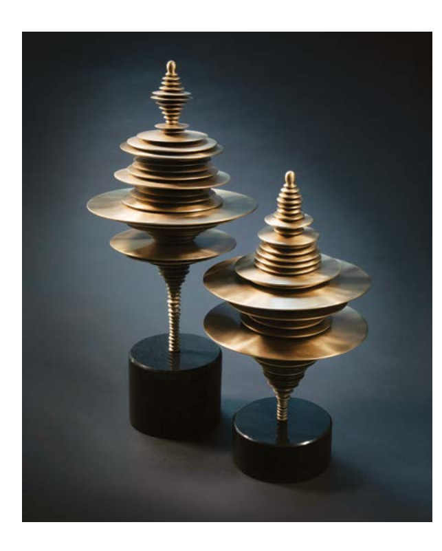
Bush Wren I, 2019. Bronze, 15 in. high x 9½ in. diameter Bush Wren II, 2019. Bronze, 14 in. high x 8 in. diameter