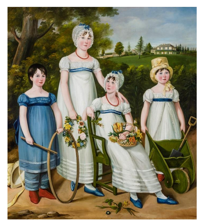
ENGLISH NAIVE SCHOOL Portrait of Four Children in a Country Landscape, about 1810 Oil on canvas, 60 x 54 inches