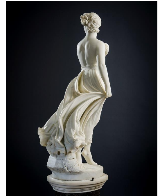
THOMAS RIDGEWAY GOULD (1818–1881) The West Wind, modeled in 1869-70 Marble, 48 in. high